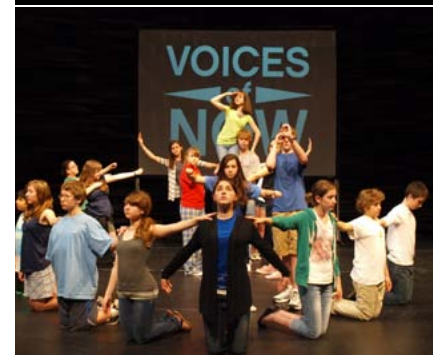
Voices of Now students showcase their final work