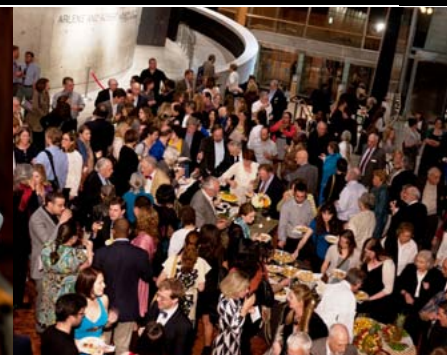
Crowd gathers at opening night of Ah, Wilderness!