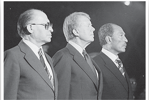
The cast of Camp David (left) recreates the famous image (right) of Menachem Begin, Jimmy Carter and Anwar Sadat.